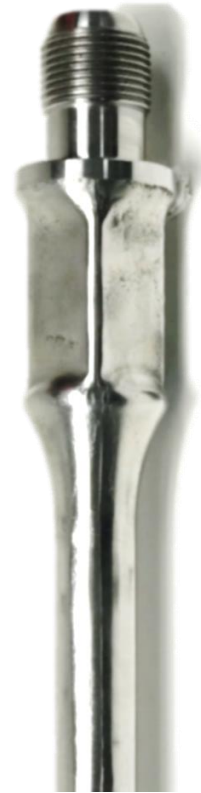
Weatherford EX stainless-steel sucker rods provide superior strength and long-lasting durability in corrosive environments.