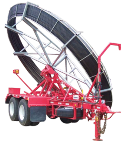
COROD continuous rod extends the life span of tubing by eliminating localized contact loads caused by couplings. Installation is quick, and Weatherford offers a full array of field servicing options.

COROD continuous rod provides a superior alternative to conventional sucker rods. Unlike conventional sucker rods, which are coupled every 25 or 30 ft (7.6 or 9.1 m), COROD continuous rod requires couplings only at the top and bottom of the rod string, regardless of well depth. This innovative solution reduces pin and coupling failures by decreasing the number of threaded connections, thereby minimizing the potential for rod string failures and costly well interventions. Uniform contact loads and a lighter weight reduce motor power requirements.