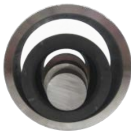
Conventional sucker rod with slim-hole coupling