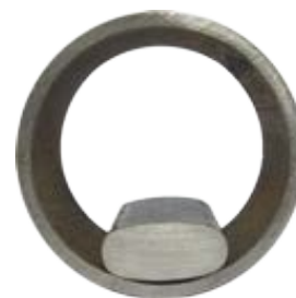
Semi-elliptical COROD continuous rod