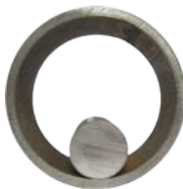
Round COROD continuous rod